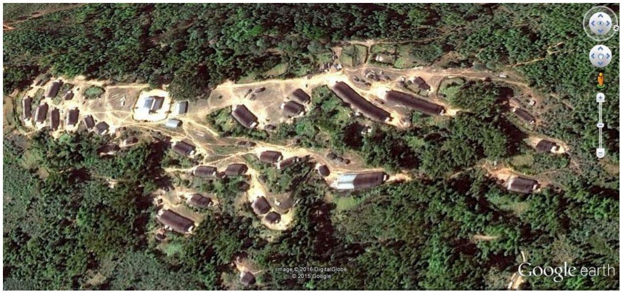
Parng Lom village from Google earth