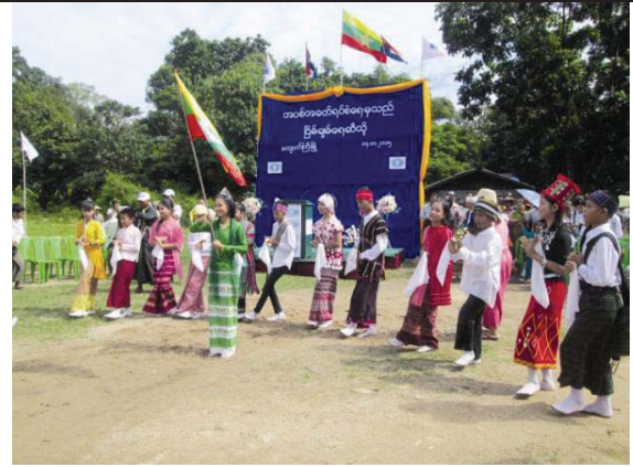
This photo was taken by a KHRG community member on October 14 th 2015, in Ler Doh Town, Kyaukkyi Township, Nyaunglebin District. Villagers from Mone, Kyaukkyi, and Shwegyin townships gathered together to celebrate peace prior to the Nationwide Ceasefire Agreement (NCA) being signed. The villagers requested permission from the Myanmar government to hold this celebration.