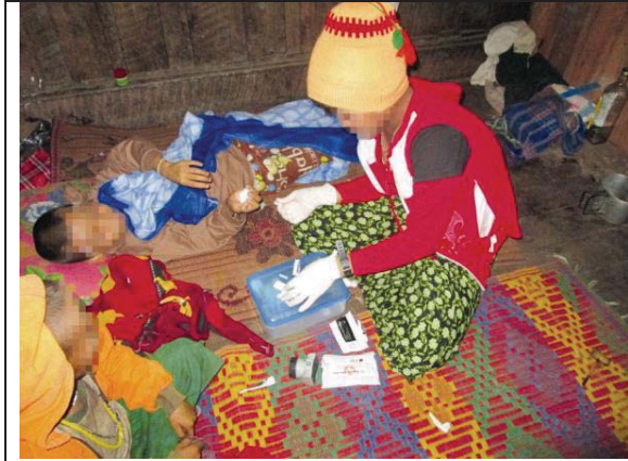
This photo was taken by a KHRG community member on November 11 th 2014, in B--- village, Meh Klaw village tract, Bu Tho Township, Hpapun District. The photo shows a KNU health department female medic conducting a malaria test for children in the village. In 2014, the KNU placed one medic per 30 households to check for malaria in each village in Meh Klaw village tract. The Myanmar government also used to provide medics for malaria in this village but they left after the KNU carried out this project.