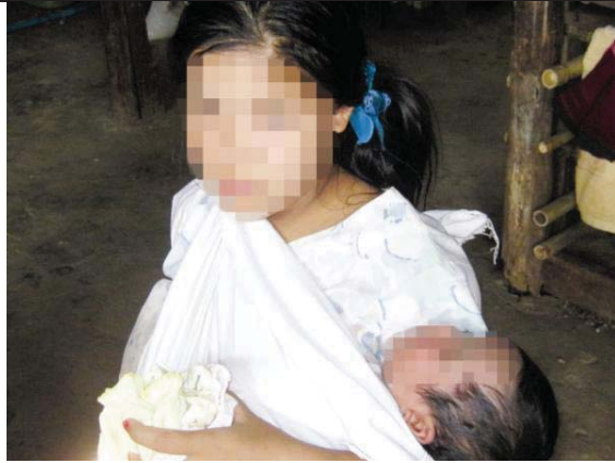
This photo shows Naw A--- from B--- village, Kawkareik Township, Dooplaya District who was raped when she was 16 years old. She was described by some villagers as suffering from a mental health condition. For more information on this case see Family involvement in GBV case resolution in this chapter.