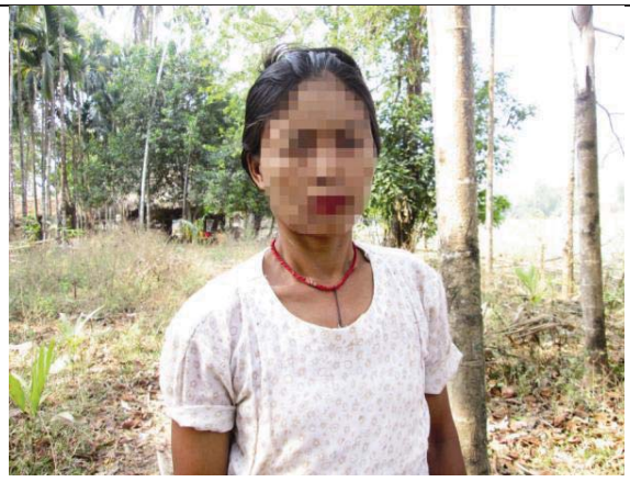
The above photo, taken on April 5 th 2014, shows Naw M--- in D--- village, Waw Muh village tract, Dwe Lo Township, Hpapun District. Naw M---’s land was destroyed due to water erosion from a gold mining project near Buh Loh River. For more information on this case see the sub-heading Natural resource extraction in this chapter.