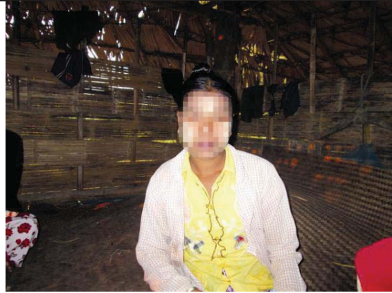
This photo is of Ma L---, a 28 years old female villager from D--- village, Bu Tho Township, Hpapun District, taken on December 22 nd 2013. Ma L--- was sexually assaulted on an unknown date in 2013 at 11:00 pm as she was falling asleep. The perpetrator entered her room and removed her clothes before she woke up and was able to alert her elder sibling who then entered the room. For more information on this case see Family involvement in GBV case resolution in this chapter.