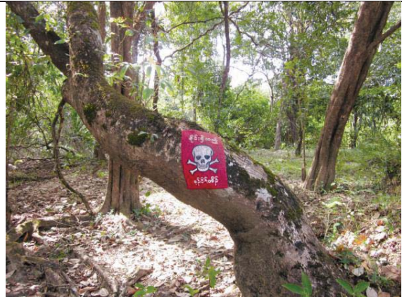
This photo was taken by a KHRG community member on December 21 st 2014, in Kheh Der village tract, Kyaukkyi Township, Nyaunglebin District. The sign says, in both Karen and Myanmar languages, "There are landmines."