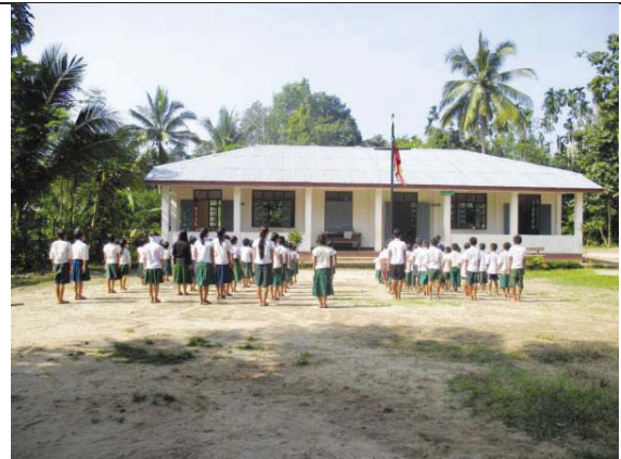
This photo was taken by a KHRG community member on September 21 st 2015, in K--- village, Kawkareik Township, Dooplaya District. The photo shows children attending a government primary school, singing the national anthem of Myanmar in the morning in front of the school and the flag. There are a total of 70 students, two male teachers, and four female teachers at the school.