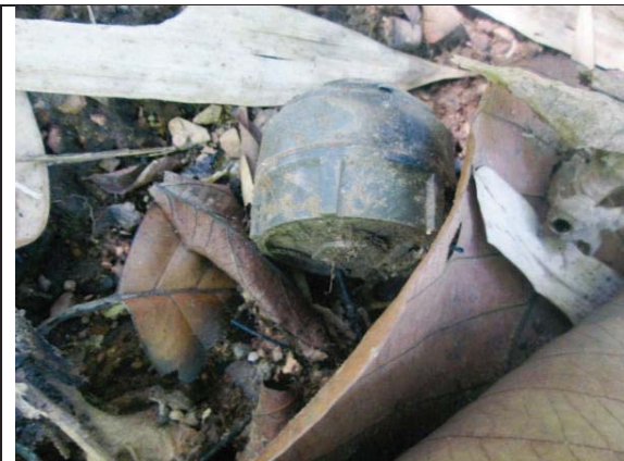
This photo, showing a landmine, was taken by a KHRG community member on June 2 nd 2014, on Meh Baw Kyoh hill, Meh Klaw village tract, Bu Tho Township, Hpapun District. There had previously been a Tatmadaw army camp in the Meh Baw Kyoh area, but the area has since been used by villagers to work and graze their buffaloes. Villagers reported being worried that their livestock might step on landmines. The Tatmadaw has informed villagers not to go into the area as many landmines are still there.