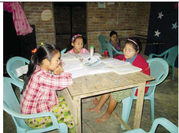
These photos were taken by a KHRG community member on January 6 th 2015, in D--- village, Toungoo District. It shows students in Standard 4 at their school. Villagers reported that the children were trying to learn how to read and write the Myanmar language alphabet, but that they were not able to do so due to poor teaching.