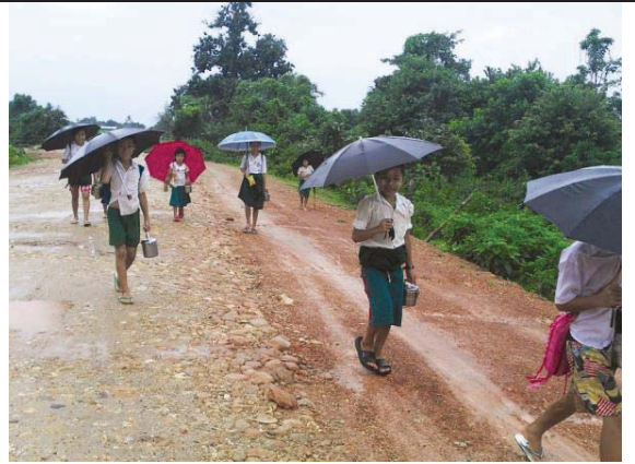
This photo was taken by a KHRG community member on July 13 th 2015, in Kawkareik Township, Dooplaya District. This photo shows students returning from school after their teachers told them that the school was closed due to fighting in the local area between the Tatmadaw, BGFs and the DKBA on the Asian Highway between Myawaddy Town and Kawkareik Town. The teachers closed the school out of concern for their students' safety.