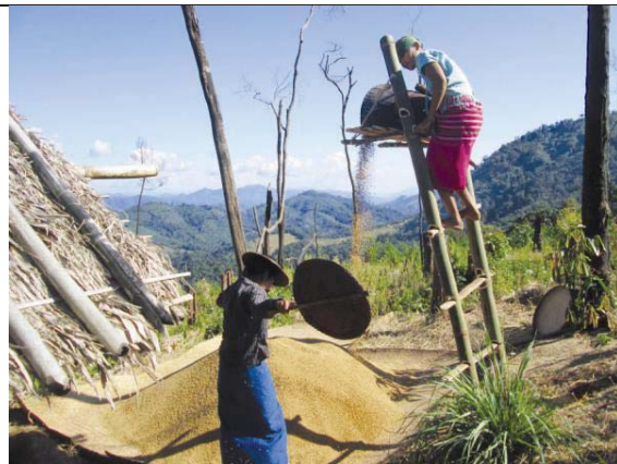
This photo was taken on November 13 th 2014, at a hill farm in H--- village, Daw Poo village tract, Hpapun District. The photo shows two women winnowing rice, an ancient technique which separates the grain from the chaff.