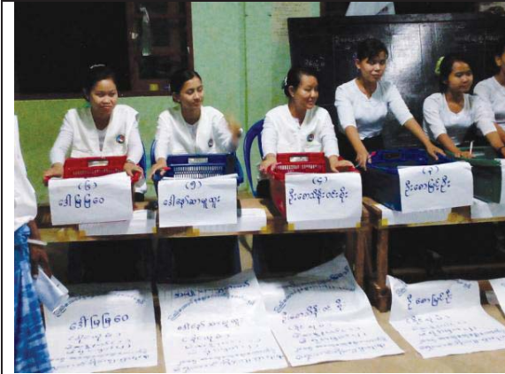
This photo was taken by a KHRG community member on November 8 th 2015, in Kyonedoe Township, Dooplaya District. The photo shows female teachers assisting in the vote counting process for the country-wide general election.