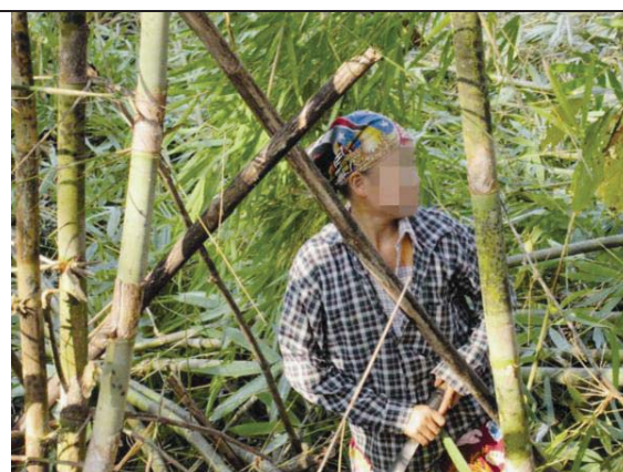
This photo was taken on February 14 th 2015, in D--- place, Kyainseikgyi Township, Dooplaya District. The girl in the photo was working on her family's hill field and did not attend school. Her family consists only of her sister, herself and widowed mother. According to the KHRG community member who took this photo, the young girl had to work very hard on the hill field farm and as a result did not get the opportunity to study.