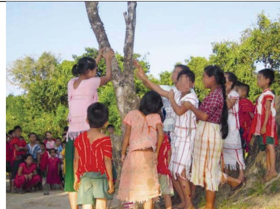
This photo was taken by a KHRG community member on December 19 th 2012, in H--- village, Bu Tho Township, Hpapun District. The photo shows middle school students playing during a break at their school.