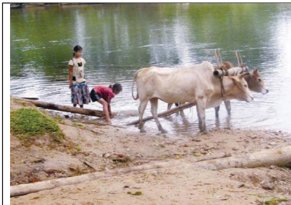
This photo was taken on October 10 th 2012, by a KHRG community member in K--- village, Day Wah village tract, Hpapun District. It shows two young girls engaged in a typical livelihood activity. The cows are pulling logs which the girls will sell at the market.