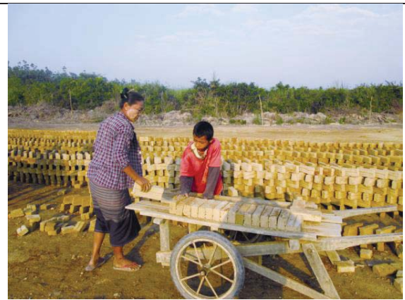
This photo was taken by a KHRG community member on January 21 st 2015, in Noh Ta Hsuh village, Noh Ta Hsuh village tract, Thaton Township, Thaton District. It shows a woman working to earn her living by producing bricks, and a young boy assisting her.