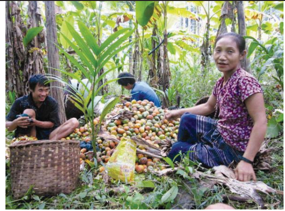
This photo was taken on December 6 th 2014, in Saw Hka Der village tract, Mone Township, Nyaunglebin District. It shows villagers harvesting betel nuts.