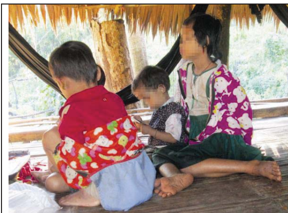
This photo was taken by a KHRG community member on November 13 th 2014. This young girl (pictured right) from B--- village, Bu Tho Township, Hpapun District, was reported as being unable to attend school as she looked after her little brother and sister while her parents were harvesting in the field. She was not able to go to school because her family faced livelihood issues and her parents could not afford to support her education, as they struggled to secure food for the family to survive. In addition, the place where they live is far from the nearest school.