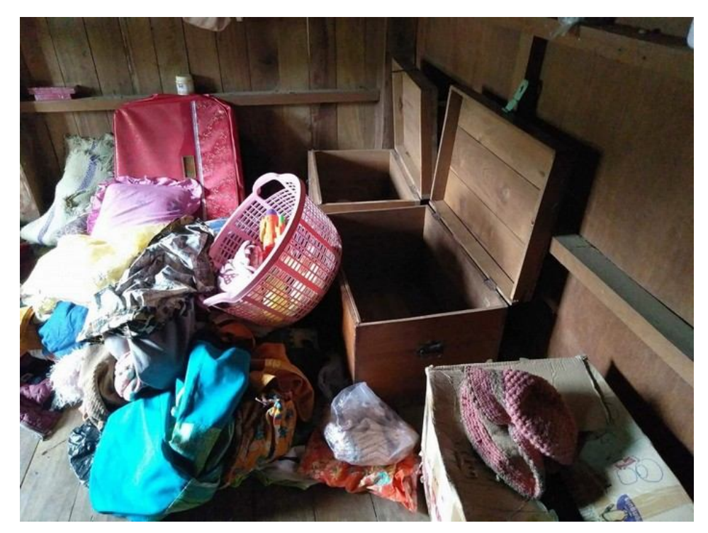
Local villagers' property ransacked by Burma Army