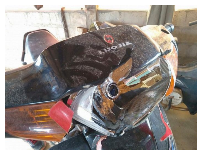
Motorbike destroyed by Burma Army

As the soldiers at the front entered the village, the soldiers in the rear were still coming down the hill. At that time, two landmines suddenly exploded about 90 meters away from the village and killed two soldiers instantly. Assuming they were under attack, the Burma Army troops began shooting indiscriminately in all directions, for about 30 minutes. The house of a woman called Pa Kui was hit by bullets.