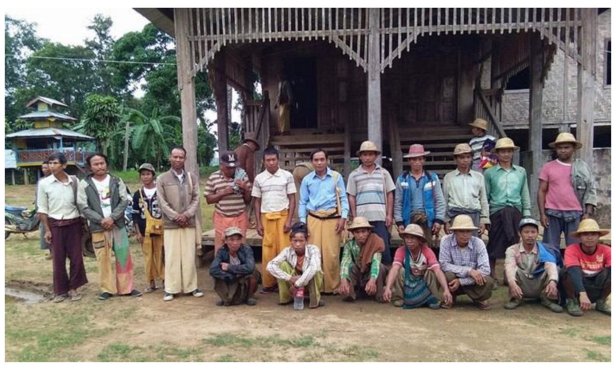
Local conscripted villagers and SNLD MP at Pang Kaen monastery

Col. Aung Naing Htoo told them: "During our clearance operation, we called the villagers to guide us because we didn't want to arrest the wrong people. We don't know who are civilians and who belong to armed groups. So, we just called them to come with us. We will release them very soon."